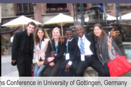
Delegation to Model United Nations Conference in University of Gottingen, Germany