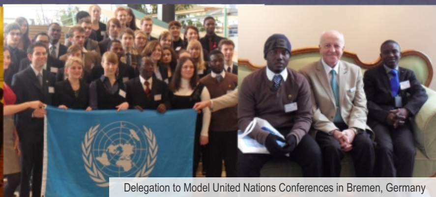
Delegation to Model United Nations Conferences in Bremen, Germany