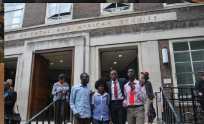
Delegation to Commonwealth Youth Leadership Conference SOAS, University of London (London, United Kingdom)