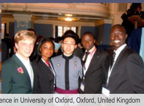
Delegation to Model United Nations Conference in University of Oxford, Oxford, United Kingdom